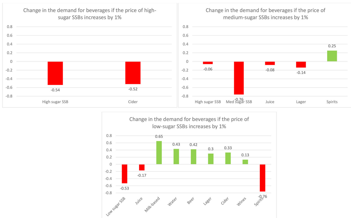
Figure 4 Change in the demand if price of SSBs increases (high-income sample; N=89 535). High-sugar SSBs include >8g of sugar per 100mL; medium-sugar SSBs include 5–8g of sugar/100mL and low-sugar SSBs have <5g of sugar/100mL.

drinks and add negative effects from diet drink price increases through the increased purchase of alcohol. Although not definitive, the relationships found in this analysis are sufficiently robust to suggest that policies – and research – concerning the price of SSBs need to consider the effects beyond the SSBs targeted and support the need for further primary research on the behaviour