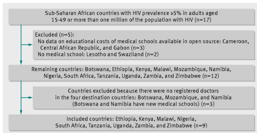
Fig 1 Flow of countries through study