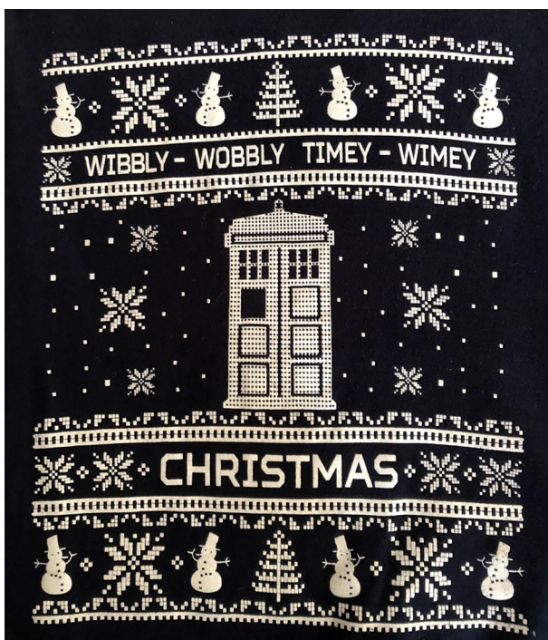
Fig 1 | The TARDIS has even landed on a Christmas jumper

The main outcome was age standardised mortality rate because, unlike crude rates, this allows a fairer comparison between populations with different age structures over time. The ONS standardises the data to the 2013 European standard population. Rates were analysed from 1964 (the year after Doctor Who was first broadcast) onwards, but to avoid confounding from the covid-19 pandemic, data after 2019 were not included. Analyses were first conducted using the age