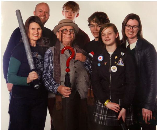
Fig 2 | Lead researcher (top left) and family members with actor Sylvester McCoy (holding umbrella) who played the seventh Doctor in Doctor Who , and actor Sophie Aldred (with baton) who played the Doctor's companion, Ace

The regression analyses used data up to 2019 and adjusted for the non-linear trend in rates over time. Some evidence suggested an association between Doctor Who episodes broadcast during the festive period and a subsequently lower annual age standardised mortality rate. When Doctor Who was shown any time during the previous festive period,